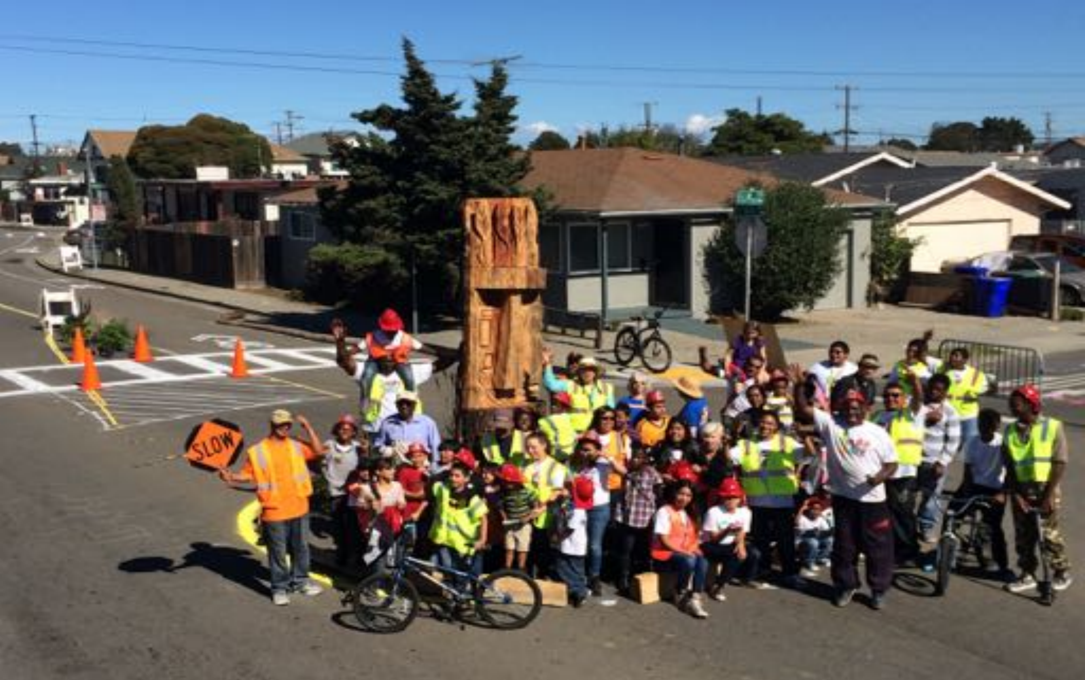
Yellow Brick Road, Richmond, CA — Living Preview