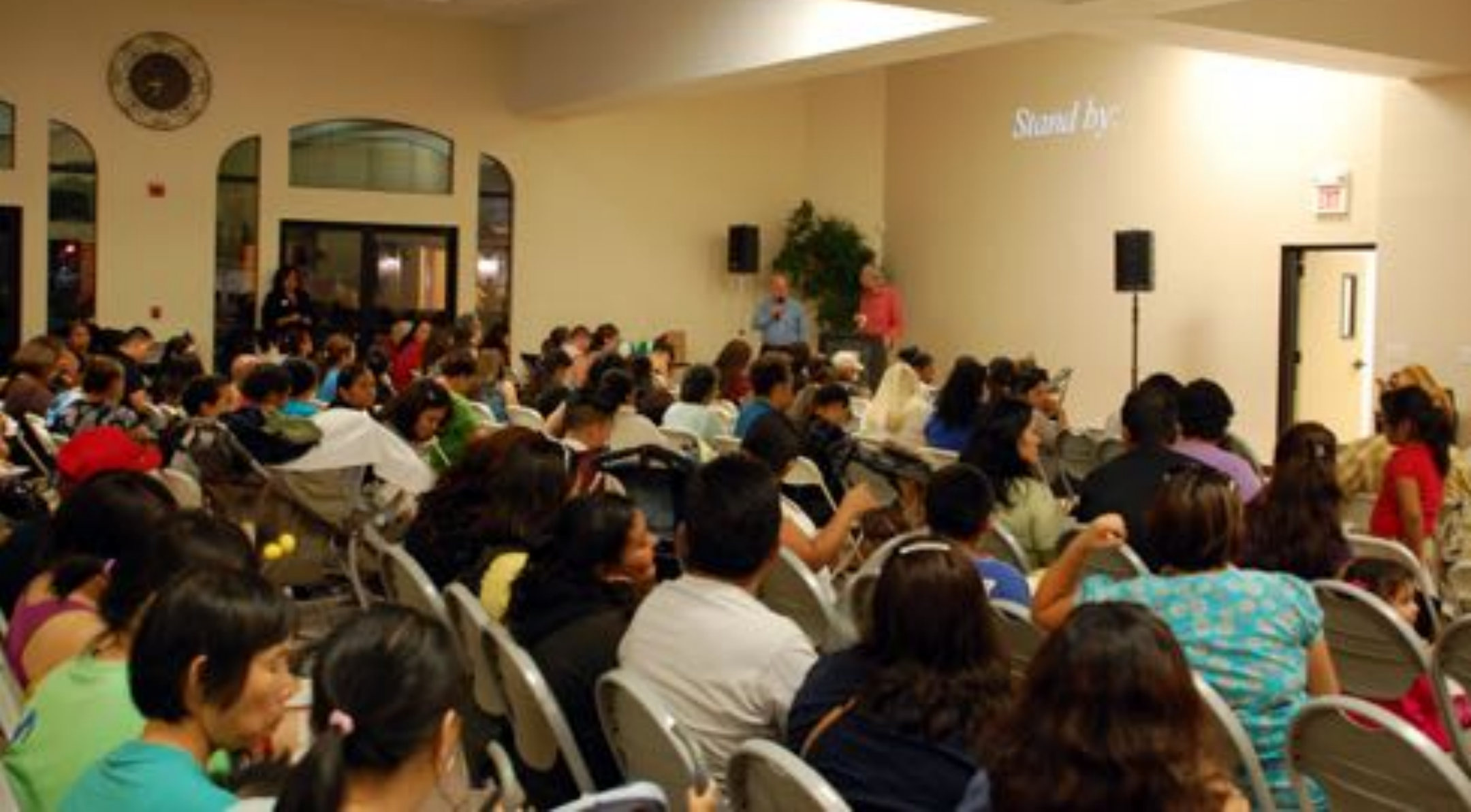
Baldwin Park, CA — Opening Workshop — October 2009