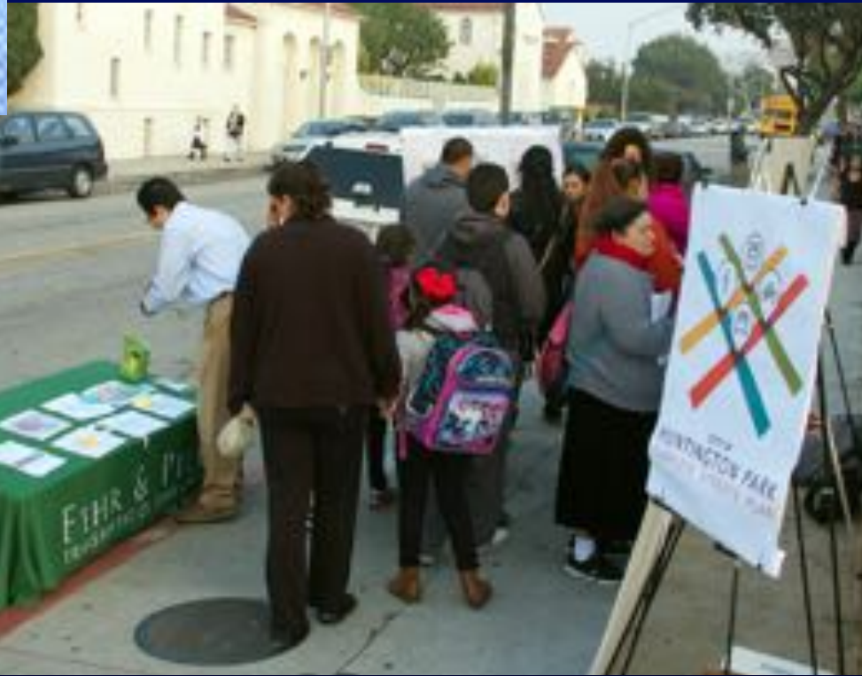
Huntington Park, CA — Pop-Up Event at Middleton Elementary — March 2015