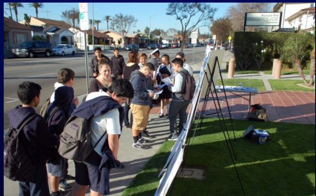
Huntington Park, CA — Pop-Up Event at City Hall — March 2015