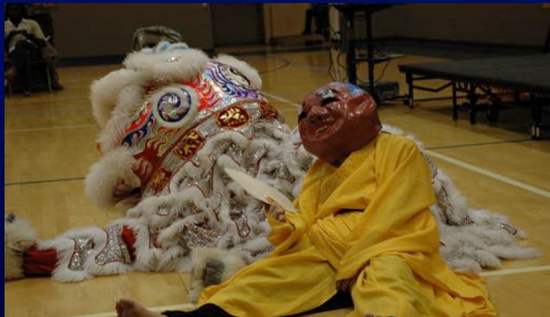
Salinas Opening Workshop, March 2007 — Taiko Drummers, Dragon Dance