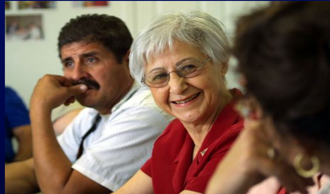
Focus Groups in Cutler-Orosi (Tulare County) with Property Owners, Business People, County Staff, Social Service Providers