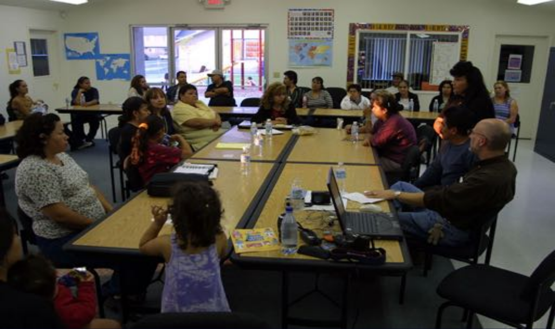
Stakeholder Group meeting in Cutler-Orosi (Tulare County) with residents of Villa de Guadalupe farmworker housing