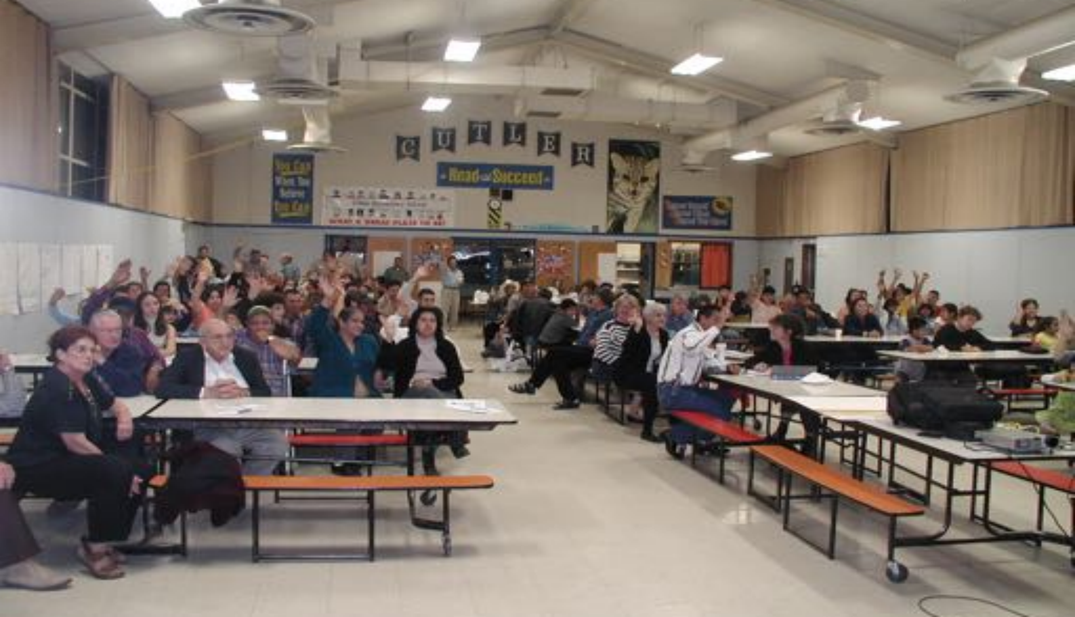
Opening workshop, Cutler-Orosi Design Fair — Nov. 2001