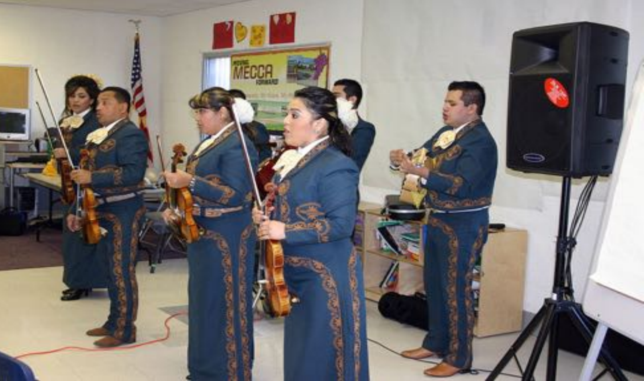
Mecca (Riverside County) Opening Workshop — January 2008