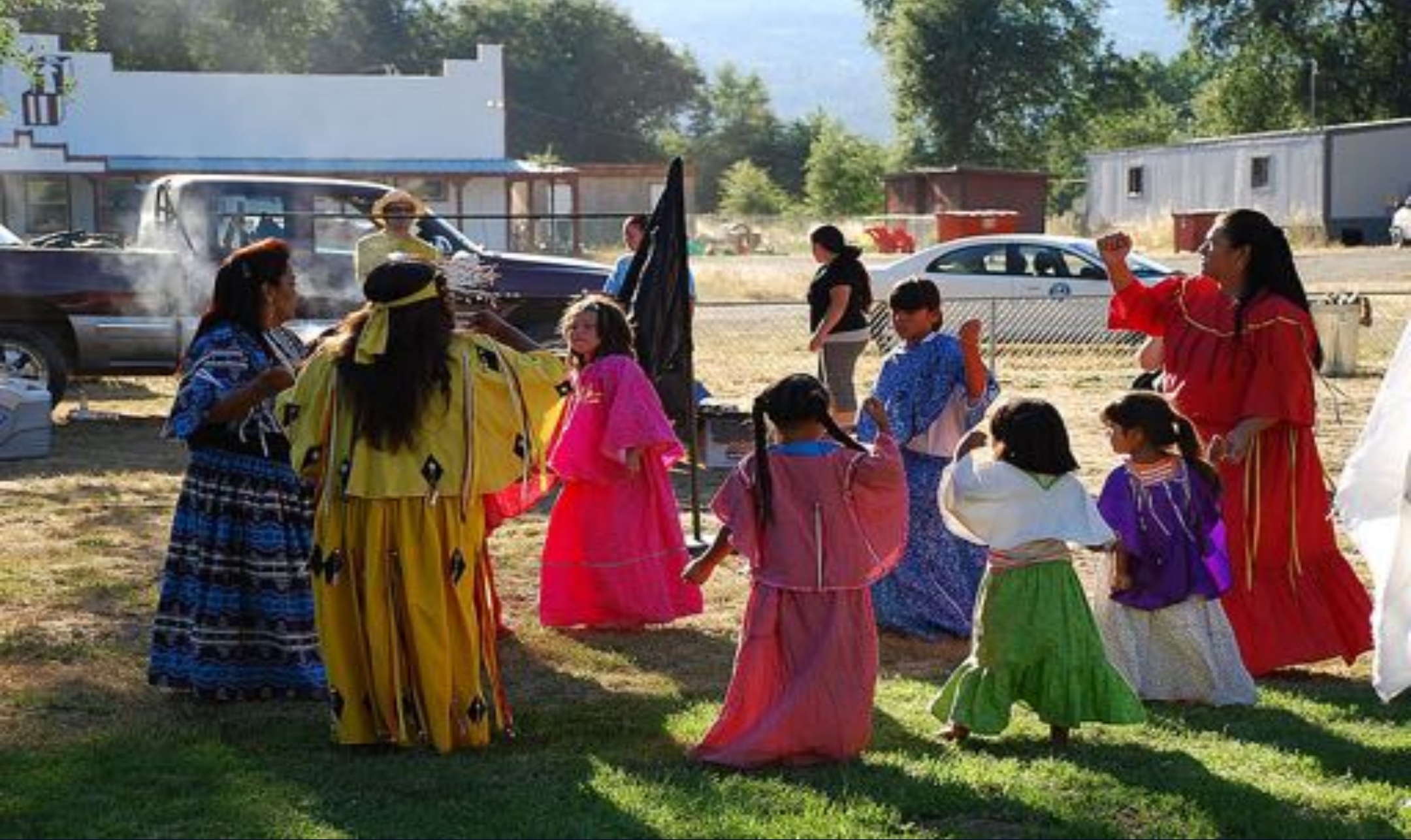
Round Valley (Mendocino County) Opening Workshop — August 2008