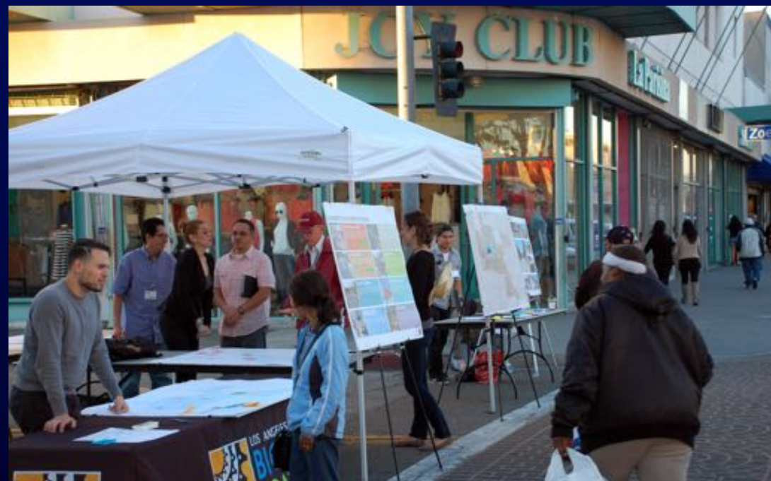
Huntington Park, CA — Pop-Up Event on Pacific Avenue — March 2015