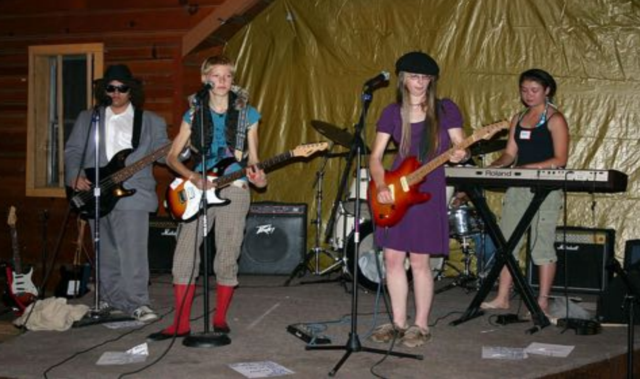
Laytonville (Mendocino County) Opening Workshop, High School Band — May 2007