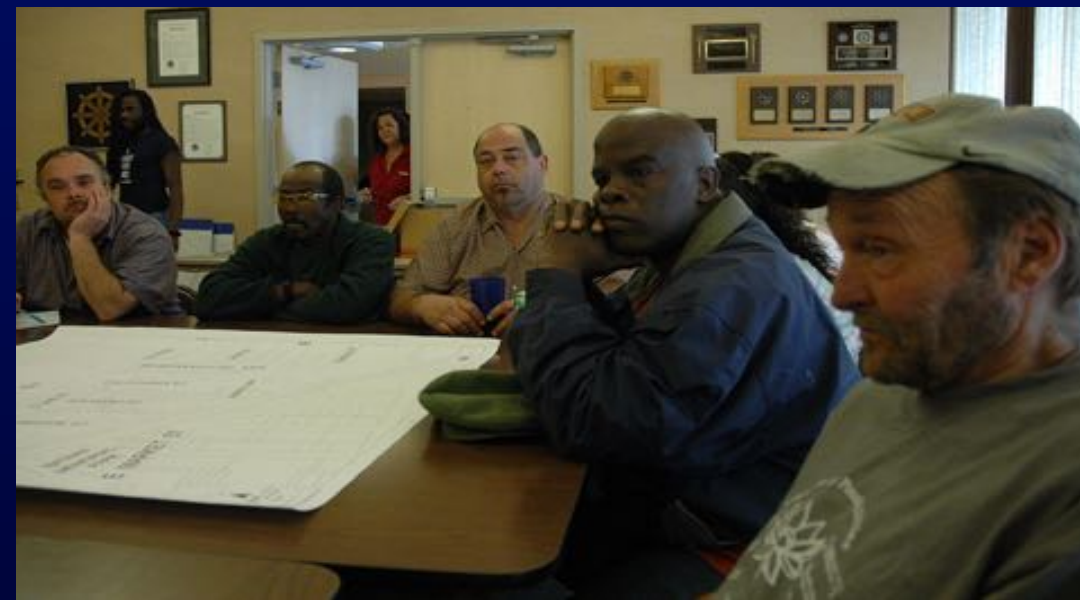
Focus Groups in Salinas (Old Chinatown) with Social Service Providers, Japanese- and Chinese-American Community members, Social Service Clients