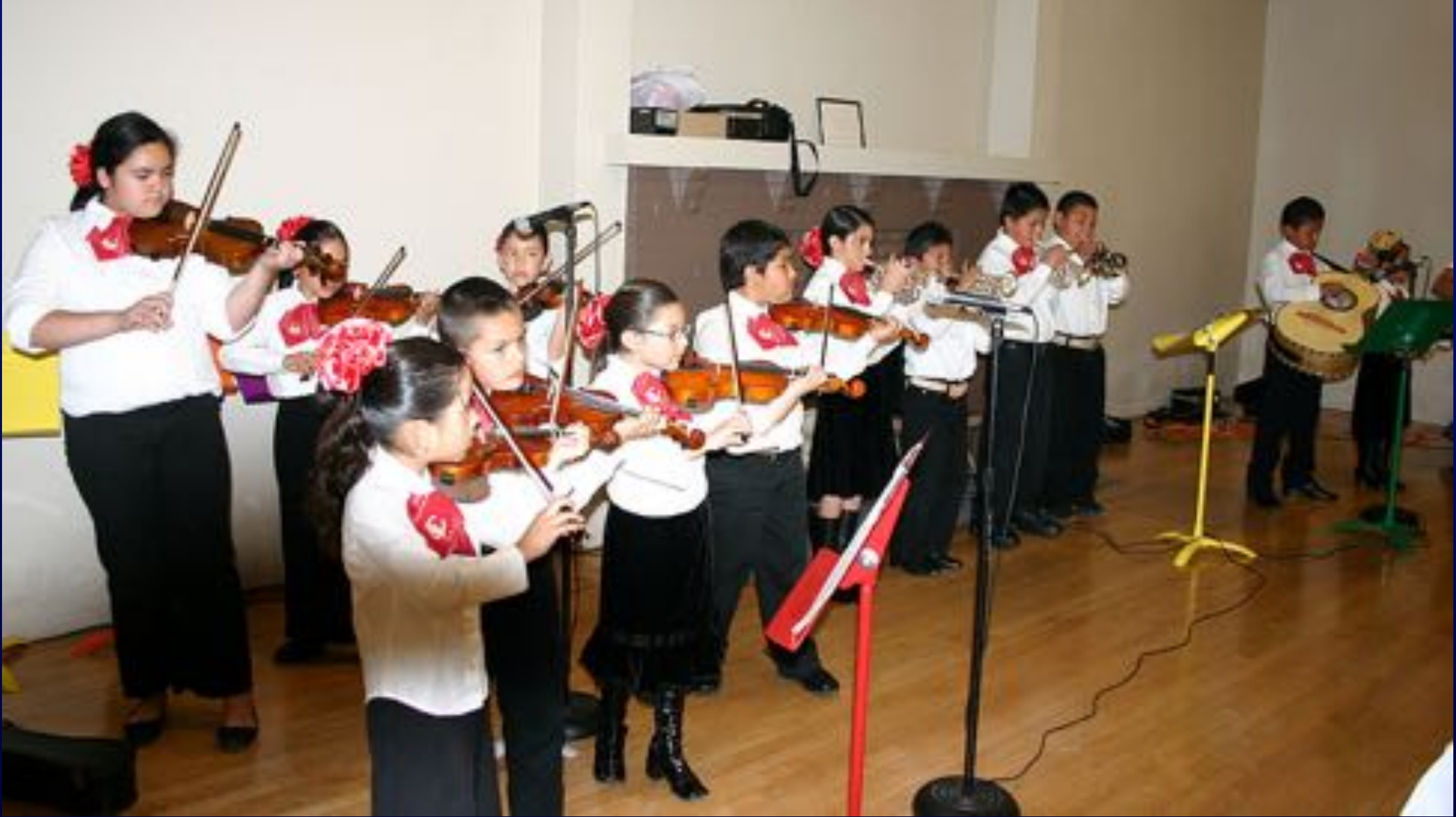
Delano, CA — Opening Workshop with Youth Mariachi Group — April 2009