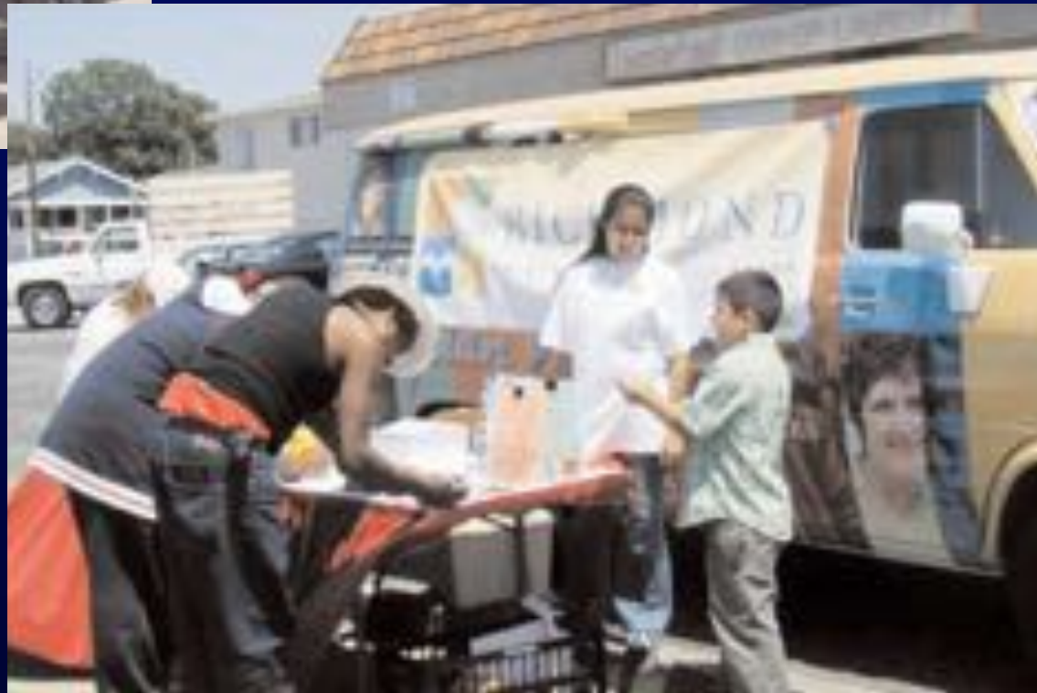
Richmond, CA — General Plan PlanVan — 2013