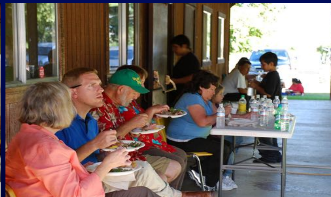
Round Valley (Mendocino County) Opening Workshop — August 2008